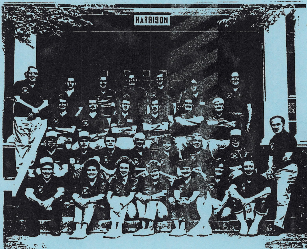
1991 HEADQUARTERS STAFF

GOOD LUCK TO ALL 1991 MOUNTAINEER BOYS' STATE CITIZENS