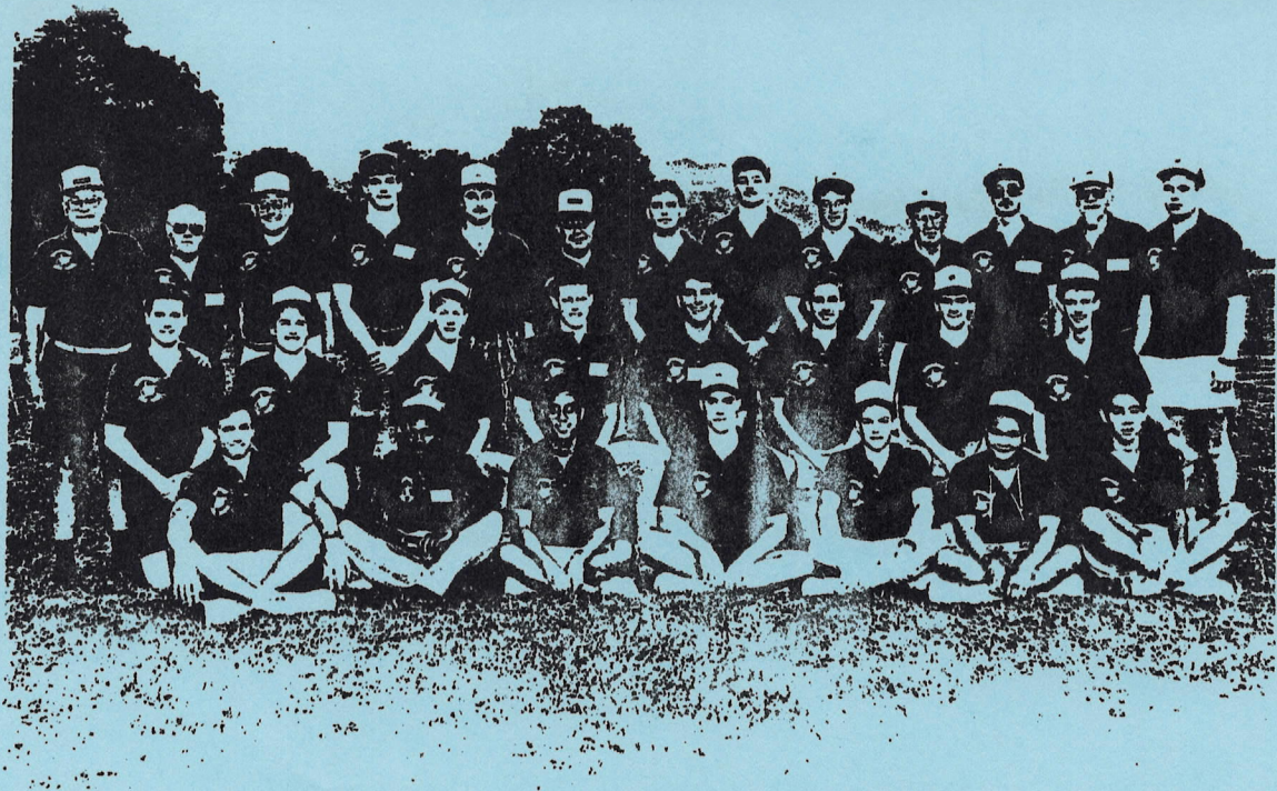
1991 JR. AND SR. COUNSELORS