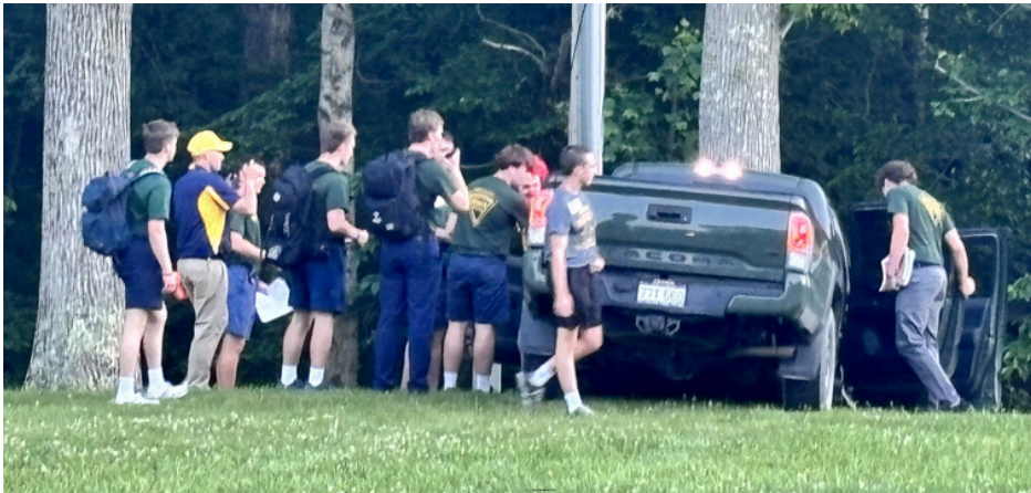
Emergency services responds to wreck at the West Virginia Building

ALMBS Col. Ashton Blair released a statement to The Mountaineer staff regarding the late Wednesday evening wreck: "At 8:30 there was a car accident near the West Virginia building two individuals were included. Both injured, both taken by EMS. One suspect in custody more will be released when we gather our evidence. That is all."