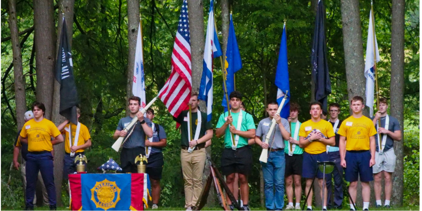
ALMBS citizens participate in the Flag Retirement ceremony