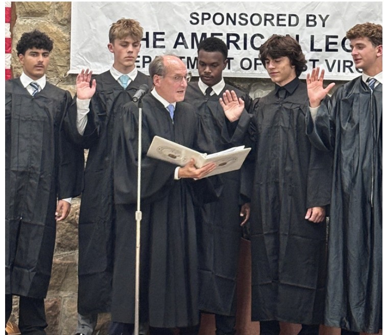
The Supreme Court gets sworn in